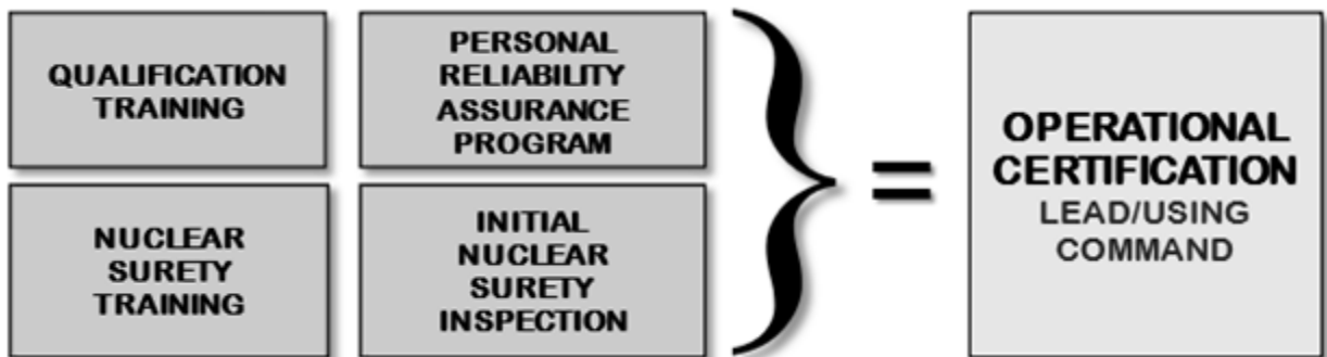
Figure 1.3. Operational Certification Components.

Program, DoDM 5210.42_AFMAN 13-501, Nuclear Weapons Personnel Reliability Program (PRP), AFI 90-201, The Air Force Inspection System, and Chairman Joint Chiefs of Staff Instruction (CJCSI) 3263.05D, Nuclear Weapons Technical Inspection.