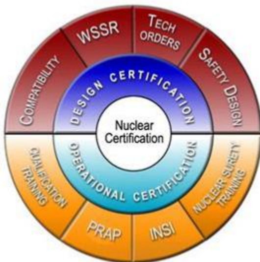
Figure 1.1. Nuclear Certification Major Elements and Components.

Legend: WSSR=Weapon System Safety Rules; PRAP=Personnel Reliability Assurance Program; INSI=Initial Nuclear Surety Inspection