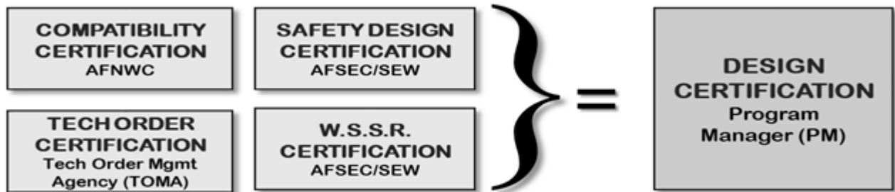
Figure 1.2. Design Certification Components.

1.3.2.1. The AFNWC, Surety and Certification Division (AFNWC/NTS) provides compatibility certification for aircraft; air-launched missile systems; support equipment; and nuclear maintenance, handling, and storage facilities. The AFNWC, ICBM Systems Directorate (AFNWC/NI) provides compatibility certification for ICBM systems. Reference Military Standard (MIL-STD) -1822B, Nuclear Compatibility Certification of Nuclear Weapon Systems, Subsystems, and Support Equipment .